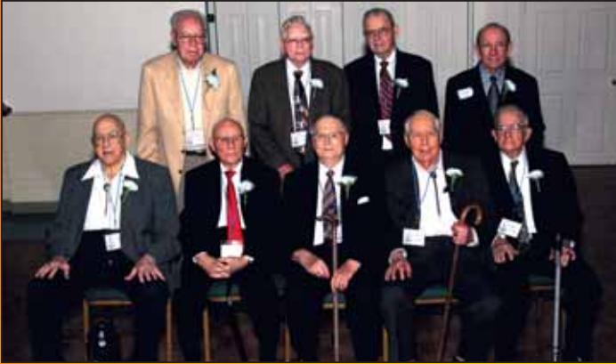
On May 2nd, 2009, a luncheon was given by Meridian Lodge #2 to pay tribute to the members of the lodge who have served Masonry for sixty or more years. There were twenty three brothers who have achieved this honor ranging in years of service from sixty to seventy. Eight of the brothers reside throughout the continental United States, six were unable to attend due to prior commitments or ill health, but we were fortunate to have nine brothers in attendance. All received or were sent their service pins and an afternoon of Masonic sociability was had by all.